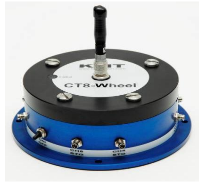
with internal Tx antenna recommend >320.....1280kbit