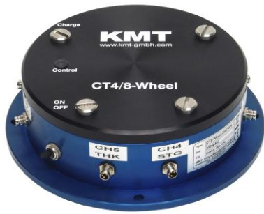
with internal Tx-antenna only for 40kbit