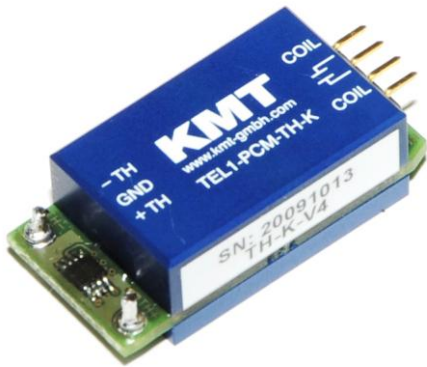
with solder pins for thermocouple

Analog signal bandwidth: 0 - 10 Hz (-3 dB) Accuracy: +/-0.5 % (without sensor) Operating temperature: - 10 to + 80 °C Dimensions: 35 x 18 x 12mm (without th-connector) Weight: each module 13 grams (with epoxy resin) Static acceleration: up to 3000g (housing not filled with epoxy resin) Static acceleration: up to 10000g (housing filled with epoxy resin and without solder pins and external capacitor!) Powering: Inductive (optional Battery, see TEL1-PCM-BATT!) Housing: splash-water resistant IP65 (except the connector pins)