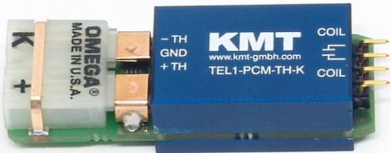
with female K type thermocouple connector

Without built-in capacitor. Only with external capacitor! E. g. 100nF for larger shaft >400mm! Specify at order!