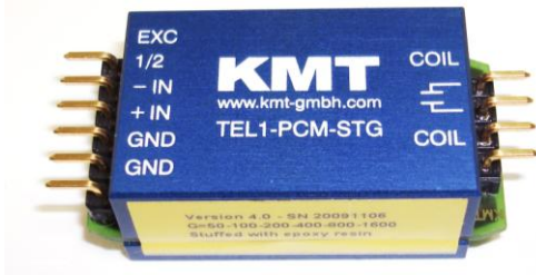
New version 4.0 without external CAL pins

With built-in 220nF capacitor for shaft up to 400mm recommend! Standard version!